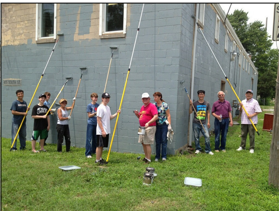
Volunteers for the July 10th Summer Missions on Wednesdays painted the outside of God’s Designs storage/workplace building.